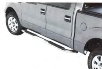
Westin 4" Platinum Oval Nerf Bars