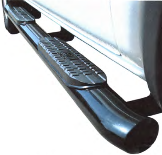
Westin Pro Traxx 4" Oval Nerf Bars