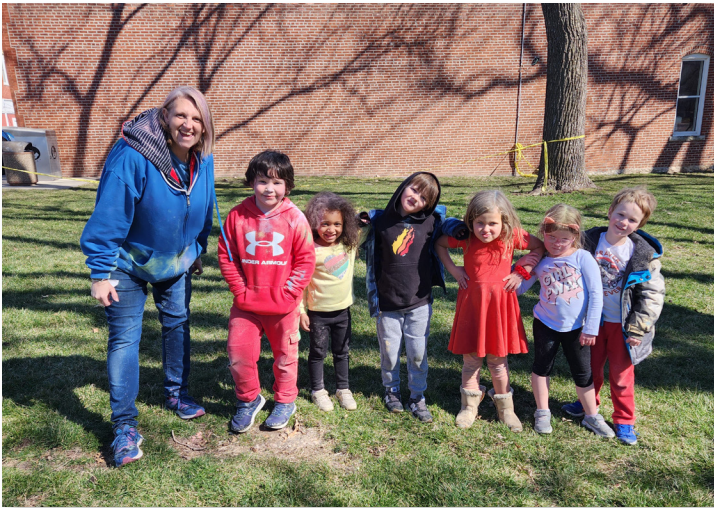
Smiling for the camera after the Color Fight during Spring Break Fun. Check out more activities from Edgerton Parks & Recreation on the back of the newsletter!