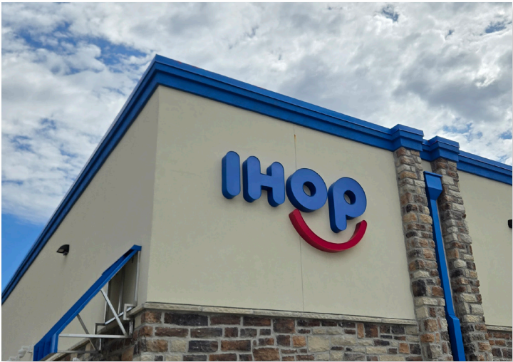
IHOP is coming to the travel plaza at 200th Street and Homestead Lane.