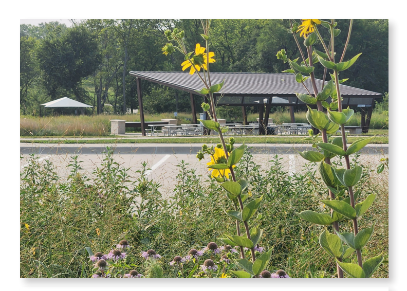
Wildflowers bloom in Big Bull Creek Park in Edgerton. The park is the largest in Johnson County.