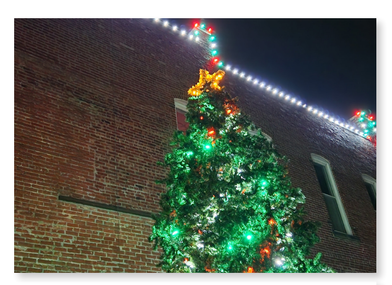
The Mayor's Christmas Tree lit up for the holidays. Last year, it was next to City Hall. In 2024, it will be back in the lawn of The Greenspace.