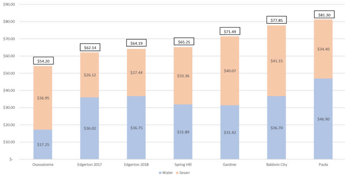
Utility Rate Comparison

NEW RATES WILL BECOME EFFECTIVE WITH THE MARCH 1, 2018 UTILITY BILLING.