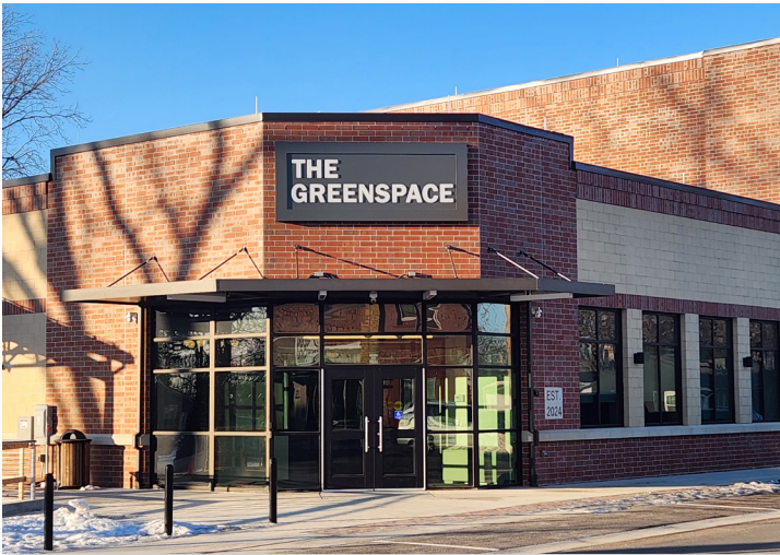
A grand opening ceremony for The Greenspace is coming up in February!