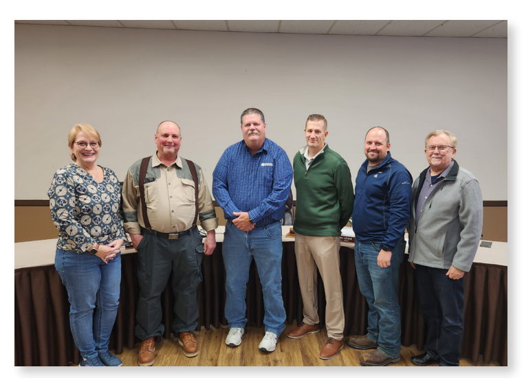
The 2024 Governing Body