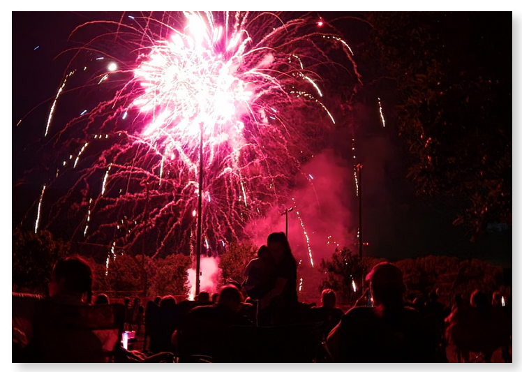
Spectators enjoying the fireworks at the 2022 Community Picnic & Fireworks event.