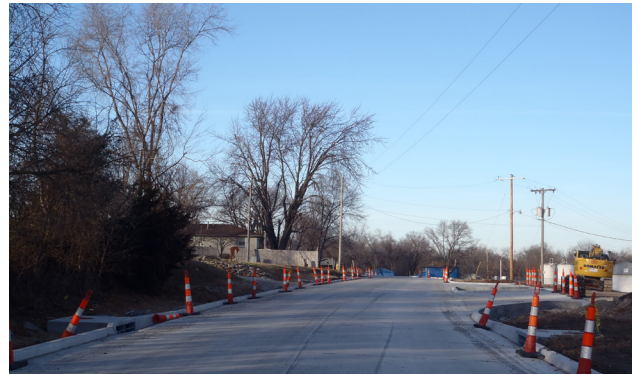
Construction cones line E. 2nd Street

All work is weather dependent. Questions or concerns? Contact Construction Inspector Todd Veeman at 913-893-6231.