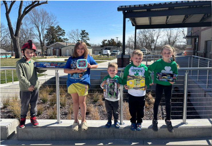
Kids smile for the camera during Edgerton Spring Break. See the insert in your utility bill for details on the 2026 program.