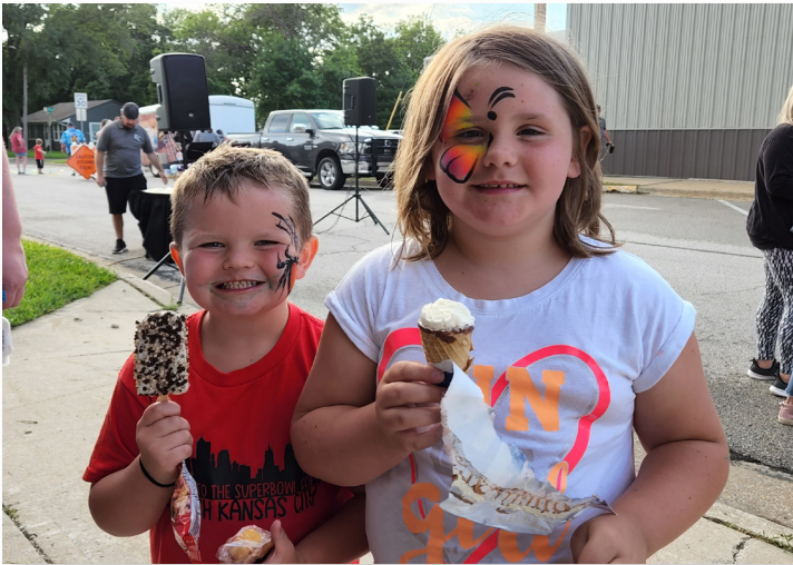
Kids enjoying their ice cream at the 2022 Summer Kick-off Block Party.