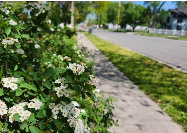
Flowers bloom in yards across Edgerton this spring.