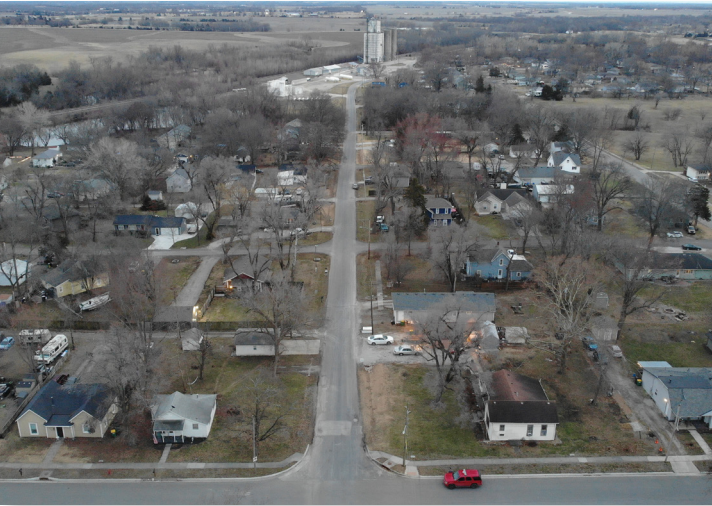
A drone shot looking south along E. 2nd Street. This section of road will be replaced this summer.