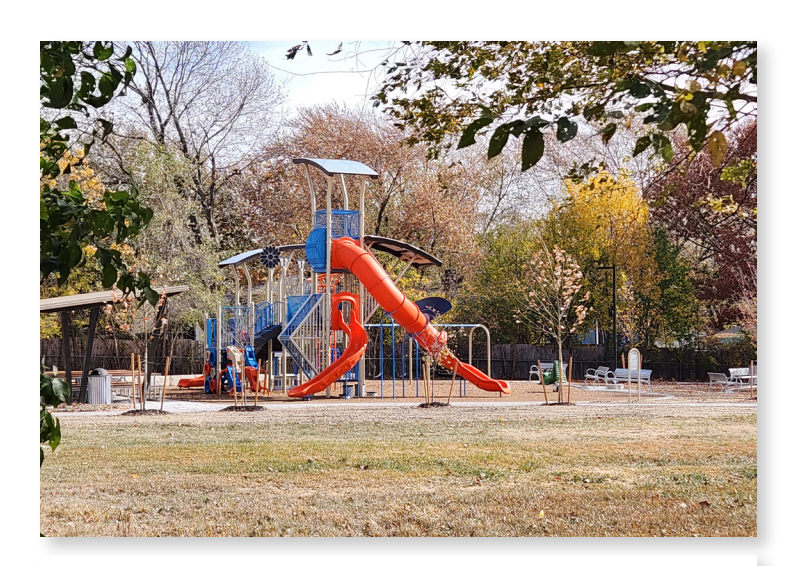
Peeking through the trees, the new playground at Glendell Acres Park is almost ready for children to play! The ribbon cutting is November 9.