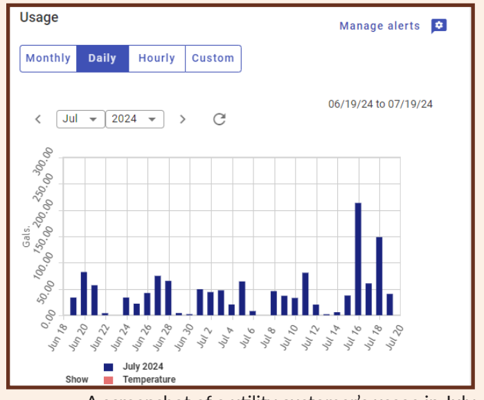
A screenshot of a utility customer's usage in July

Did you know that the City of Edgerton offers water consumption monitoring? You can sign up to get alerts when your household uses more water than expected. Log into your utility account portal and click consumption. From there, you can set up alerts to notify you when your water usage is out of the ordinary. It's easy to do and allows you to track how much water your family uses on a daily basis.