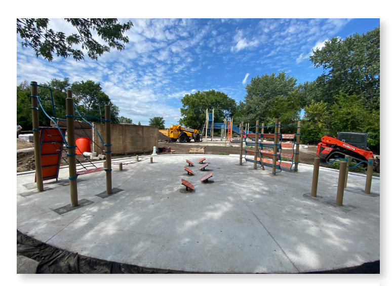
New equipment is installed at Glendell Acres Park. Look for a ribbon cutting this fall!